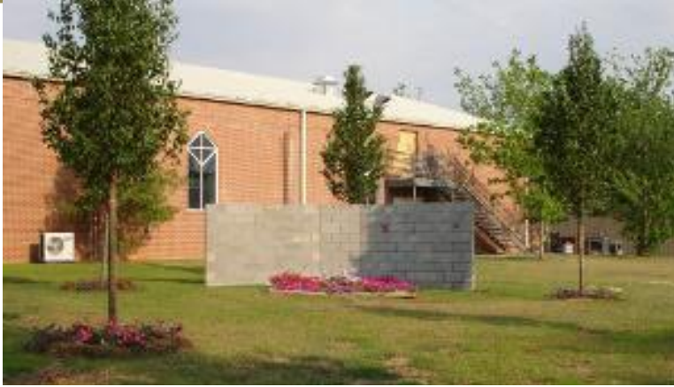
Refuge Temple, Argent Ct., Columbia