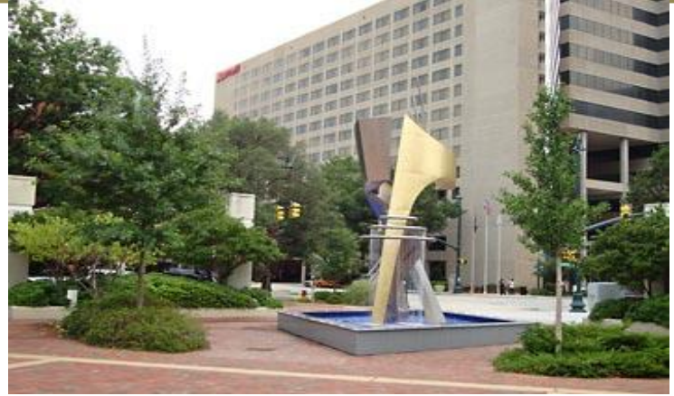
Marriott Hotel, Downtown, Columbia